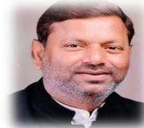
Shri Panakj Chaudhary Union Minister of State for Finance, Vice President - AJ-NIFM Society