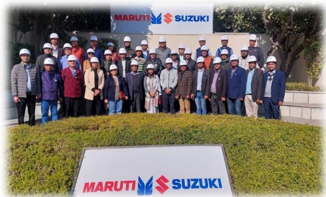
Participants of MBA (Financial Management) 2024-26 Batch – Industrial Visit at Maruti Suzuki, Manesar