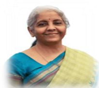
Smt. Nirmala Sitharaman Union Minister of Finance, President - AJ-NIFM Society