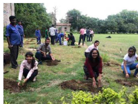
One Tree One Student, activity held at AJ-NIFM, all participants planted tree on campus