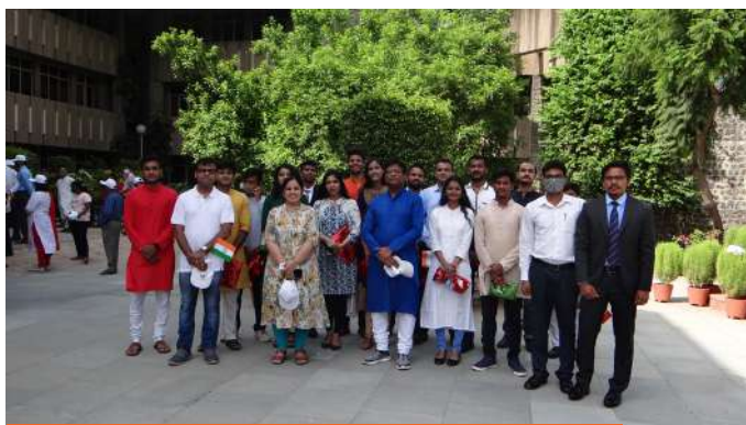
Participants of PGDM 2021-23 Celebrating Independence Day Function on 15th August 2021 in the Campus of AJ-NIFM