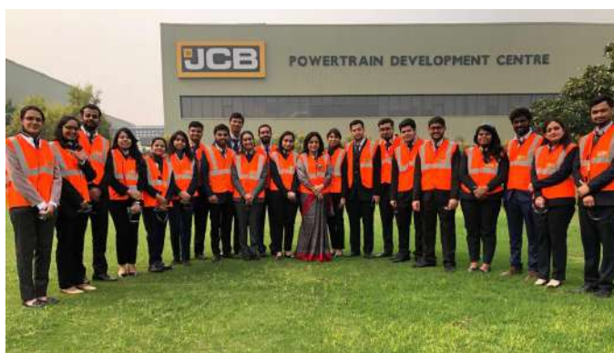
Participants of PGDM (Finance) 2019-21 batch visited JCB India Headquarters in Ballabgarh, Delhi NCR under Industrial Visit of Programme