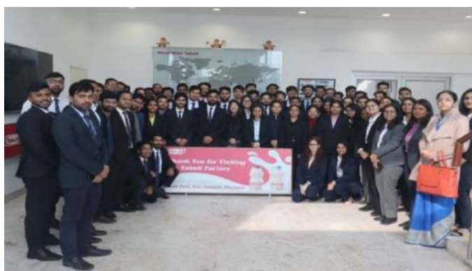
Participants of MBA (Finance) 2022-24 & 2023-25 batch visited Yakult Plant Sonapat Haryana under Industrial Visit of Programme