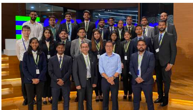
Participants of MBA (Finance) 21-23 at Singapore Stock Exchange, Singapore in October 2022 during International visit