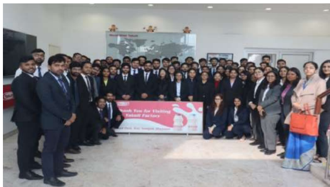
Participants of MBA (Finance) 2022-24 & 2023-25 batch visited Yakult Plant Sonapat Haryana under Industrial Visit of Programme