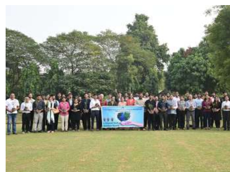
One Tree One Student, activity held at AJNIFM, all participants of MBA Finance (2023-2025) planted